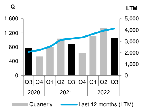
Operating cash flow, SEK m